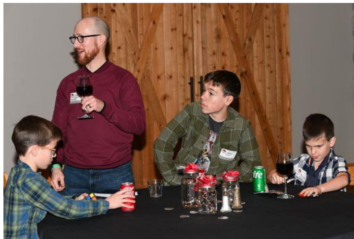
The Kikta family having a good time at the Banquet