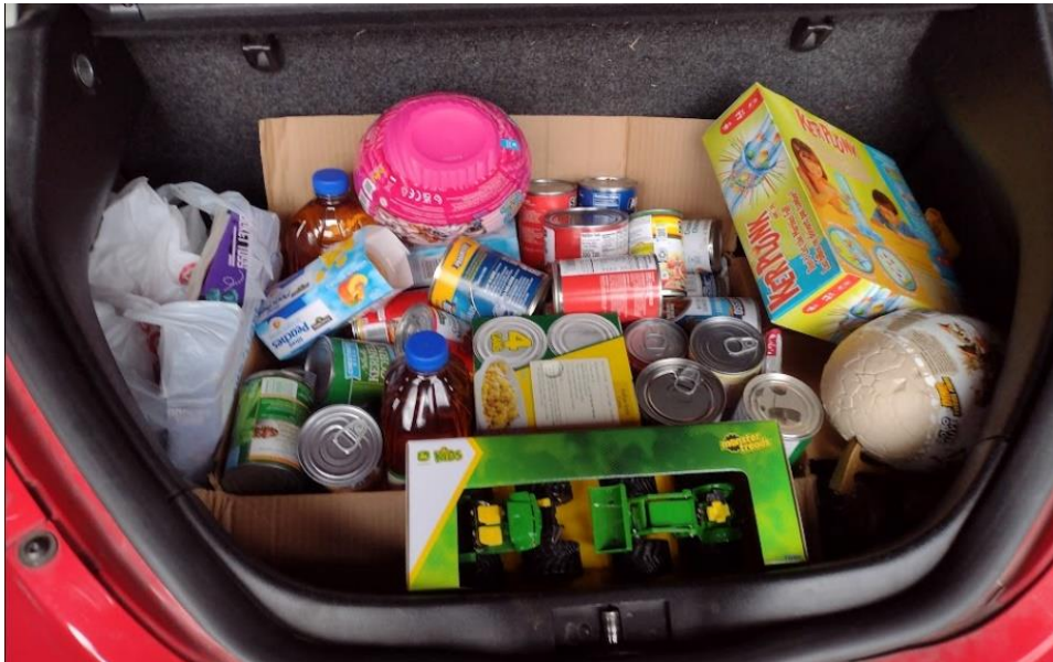
Here is the food we gave to the shelter from the December Rally.