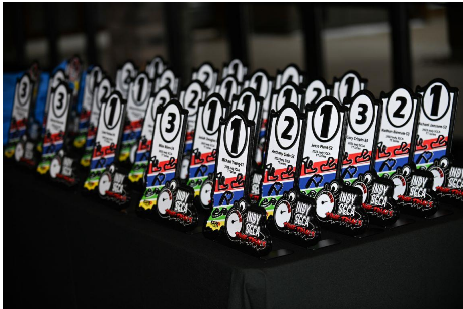
Lots of trophies at the Banquet, highlighting a very successful season in Time Trials